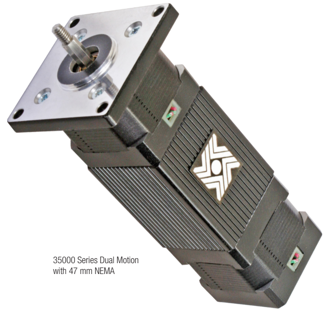
35000 Series Dual Motion with 47 mm NEMA

For a rotary/linear motor, it is desirable that the linear and rotary motions be controllable independently of one another. These devices can be run using a standard two axis stepper motor driver. Performance can be enhanced using chopper and/or microstepping drives.